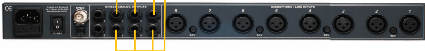
DigiMax D8 (back)

What you'll need: (6) 1/4" TRS-TRS cables